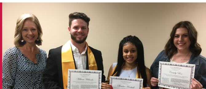
Newnan High School College Scholarship Recipients